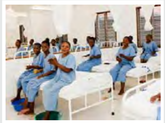
Proceeds from the Swiss Red Cross fund raising event are used to ensure continuation of relief efforts in the areas of healthcare and disaster relief across Africa, Asia and Latin America