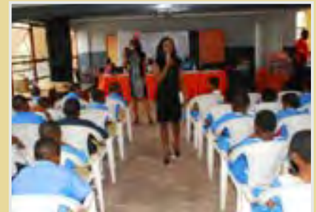
Students being addressed by a GTBank CSR officer at St. Georges Schools valedictory service.