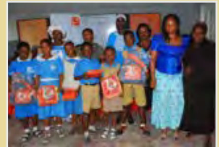
Recipients of the Orange Excellence Awards at St. Georges Boys and Girls School.

This refers to support provided to schools that are not under the adopt-a-school scheme.