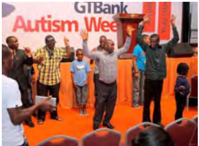
Children living with Autism dancing at the seminar

We aim to encourage social and economic opportunities through community investment activities i.e our community development projects.