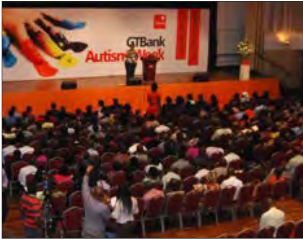
A cross-section of participants at the Autism Seminar