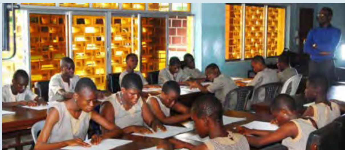
Students of Pacelli School for the blind, Surulere - beneficiary of the Children's Day initiative 2013

Orange Volunteers Programme: This is a programme by GTBank staff, Staff volunteer to provide extra classes for public school students within the community, in preparation for their external examinations. We coached the students of St. Georges Boys and Girls Primary School, for their entrance examination into secondary school and had a success record of 100% pass.