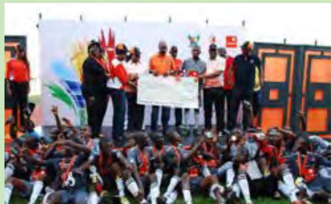
Winners of the 2013 GTBank-Lagos State Principals Cup